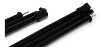
Adjustable Steel King Poles 180-220cm